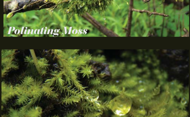
Rain drops in moss