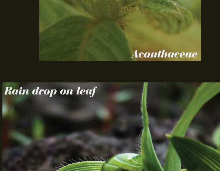
Rain drop on leaf